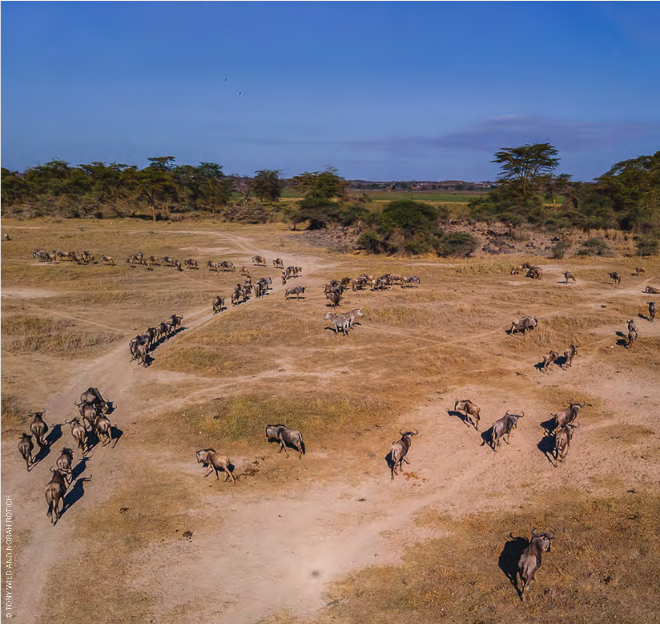
© TONY WILD AND NORAH ROTICH

KEY INSIGHTS & LESSONS LEARNT ON PAGE 10